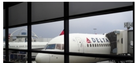
Delta Air Lines Flight Diverted Due To Odor In Cabin