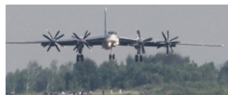
Russia sends nuclear-capable bombers on mission near South Korea, Japan